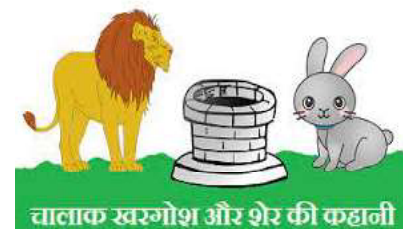
चालाक खरगोश और शेर की कहानी

अध्यापिका बच्चों से चित्रों को ध्यानपूर्वक देखने को कहें।